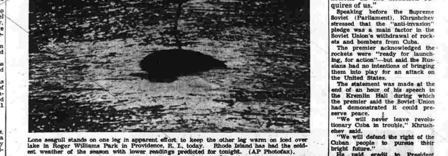
Lone seagull stands on one leg in apparent effort to keep the other leg warm on cool overcast day in Hartford, Conn.

Tells Party Reds Halted U.S. Attack MOSCOW (AP)—Premier Khrushchev said today he is holding President Kennedy to what he called pledges against an invasion of Cuba and warned if they are not kept "we will be compelled to take such actions as the situation requires of us."